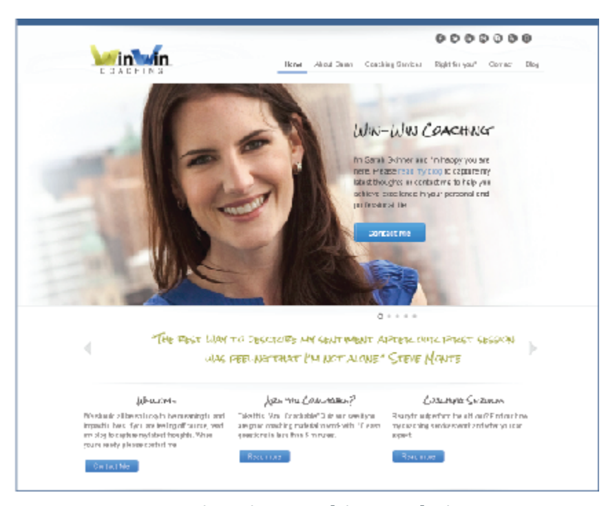
Win Win Coaching Website http://www.winwincoaching.biz